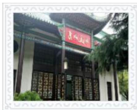
The Lute Platform