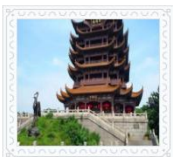
The Yellow Crane Tower

Wuhan is the capital of Hubei province, China, and is the most populous city in Central China. It lies in the eastern Jiangnan Plain at the intersection of the middle reaches of the Yangtze and Han rivers. It's very famous for a great number of tourist attractions, such as The Yellow Crane Tower (Huanghelou); Chu River and Han Street and The Lute Platform etc.